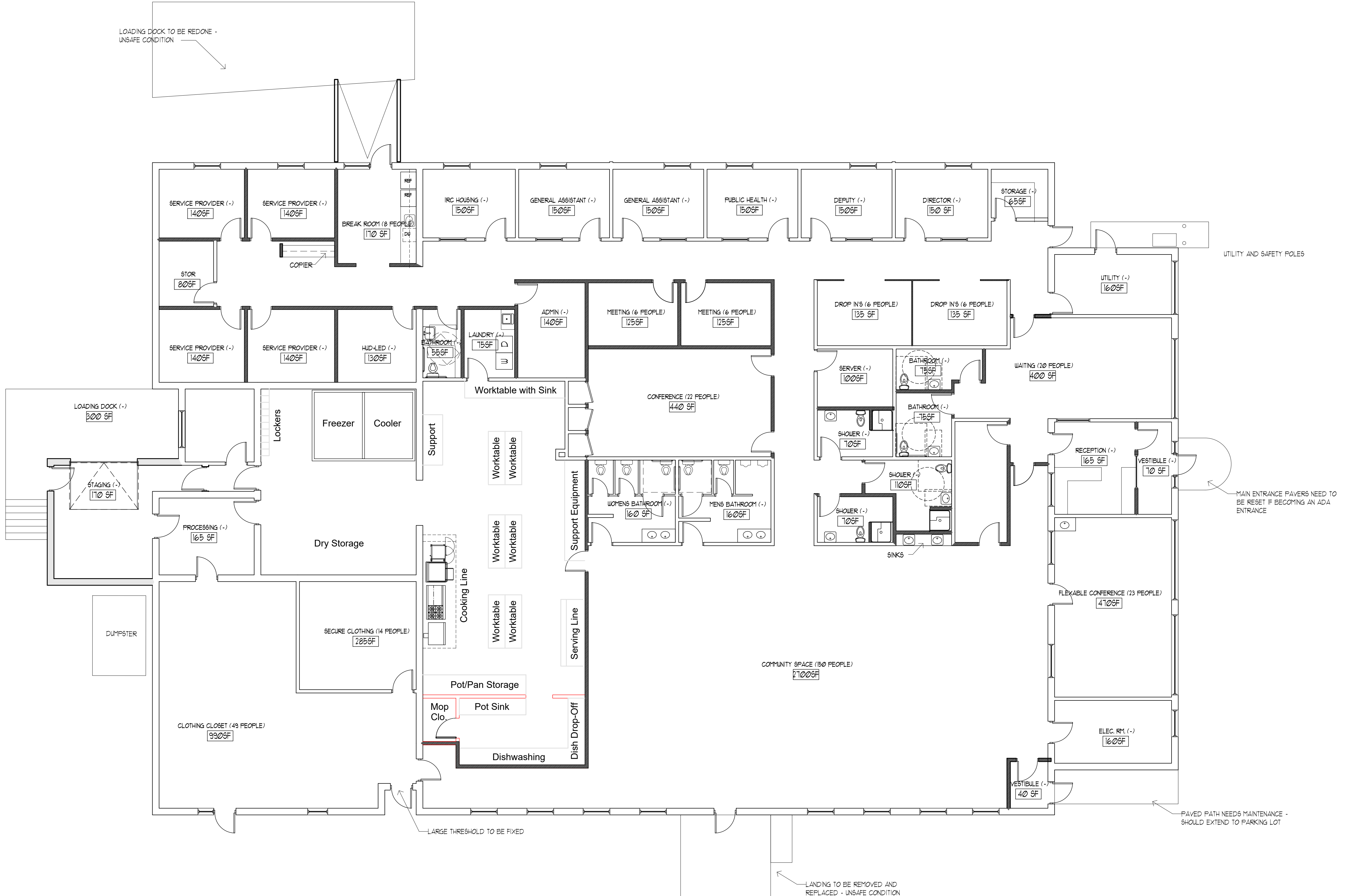
1 BUILT OUT PLAN SCALE: 1" = 8'-0"

IF THIS SHEET IS NOT 24 X 36 IT IS A REDUCED SCALE PRINT - SCALE ACCORDINGLY SCALE 1"=1' 0 1 2 3 SCALE 3/4"=1' 0 1 2 3 4 SCALE 1/2"=1' 0 1 2 3 4 5 6 SCALE 1/4"=1' 0 2 4 6 8 10 12 SCALE 1/8"=1' 0 5 10 20 40 SCALE 1/16"=1'